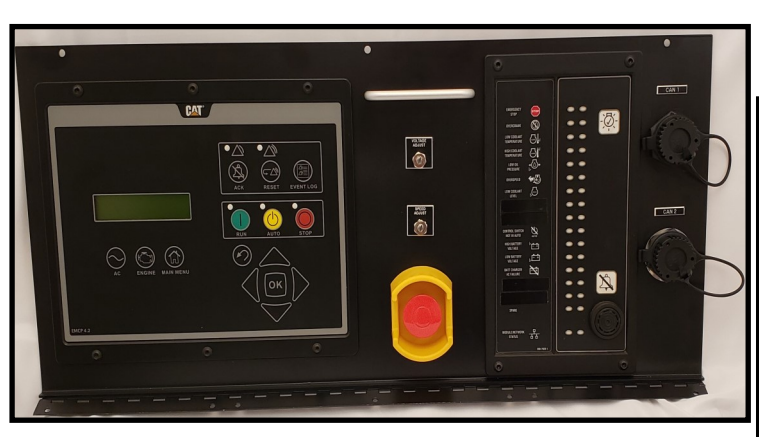
controller & annunciator not included